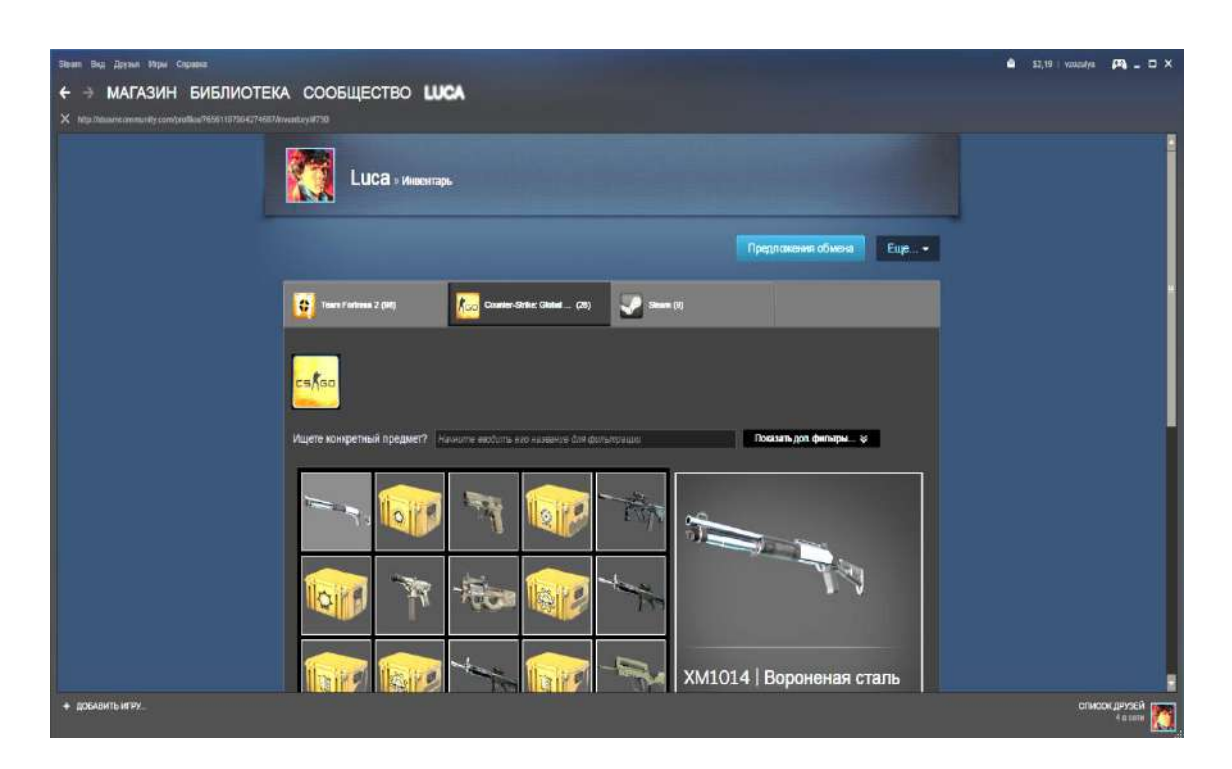
Fig. 5. The inventory of the game Counter-Strike: Global Offensive [6]

On the picture 5 there is a list of Counter-Strike: Global Offensive game stuff. Mostly there are boxes with various content inside, which drops randomly. Others are the weapon of different types and qualities. Also there are keys that help to open boxes and safes. Each item has its price that changes constantly. Prices on weapons in CS:GO vary in the interval from 3 cents to 426 USD. Weapon differs mainly by its look. Players with the help of stickers can make up brighter custom models based on standard ones, and they are called the real examples of modern art in the inner circles. Also the weapon types differ from each other by their quality, that means some of them are called a trash, and some of them are considered to be exquisite. Besides, there are collections of different stuff that include examples of a very limited edition.