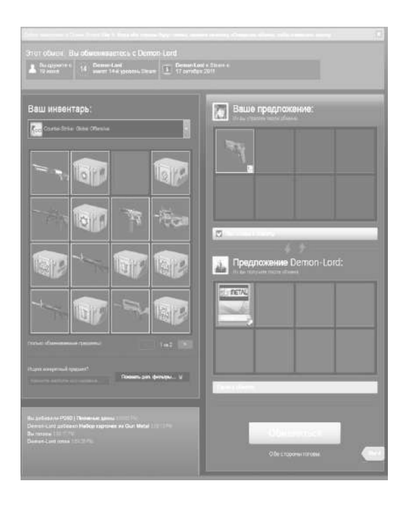
Fig. 7. The stuff exchange in Steam

But the real threaten for the Steam Market came not even from such sites, but from the criminals that try to assign another people's stuff. For better understanding of the mechanism of fooling the player, the process of the stuff exchange inside the game should be observed in more details.