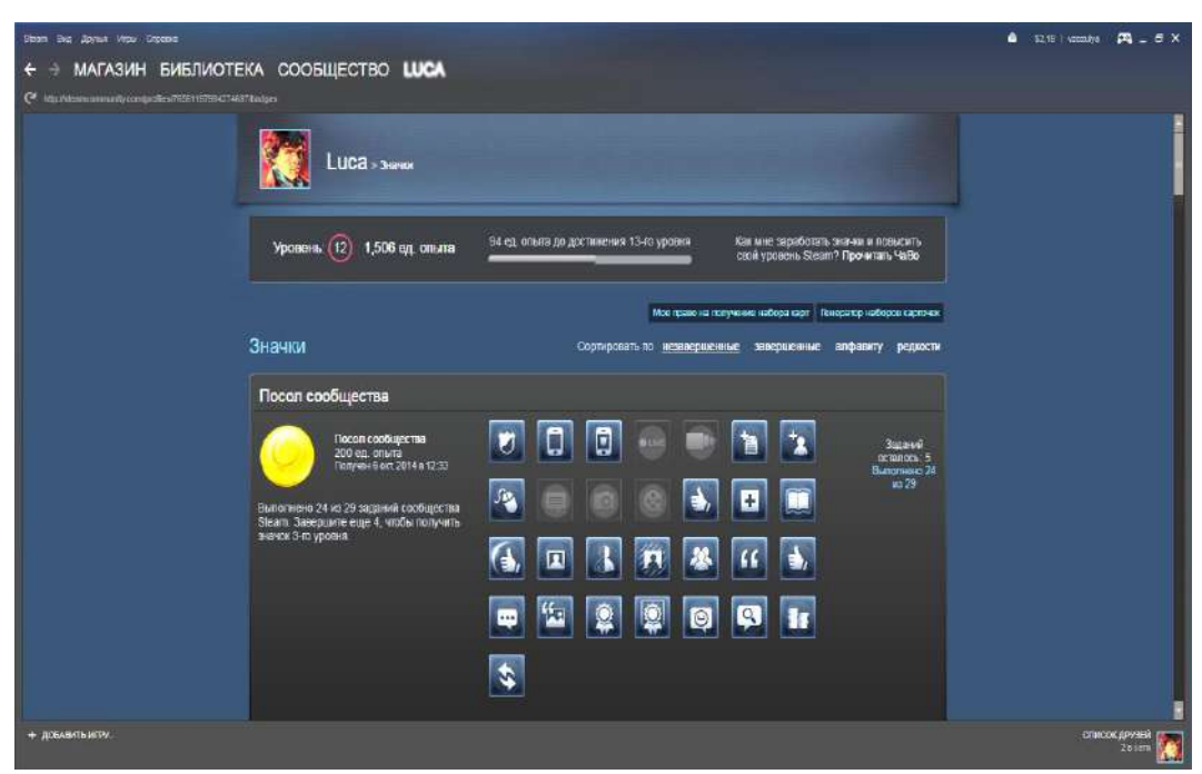
Fig. 2. Main tasks from the Steam service [3]

On the picture 1 you can see the nowadays look of the Steam network gamer's page. Each gamer can change his page a little by adding the additional information about himself or his achievements in different aspects of the Steam service, such as the amount of games purchased, progress in the gaming process or even such specific art manifestations as crafts in the Steam workshop. Every player has his rank. This rank can be improved in several ways. First is collecting the stuff belonging to some certain categories inside the game. Second is being the active player of the Steam service. Sometimes players spend money on improvement of their ranks. There are some tasks inside the Steam system that do not belong to any certain game and can be performed by service player of any rank.