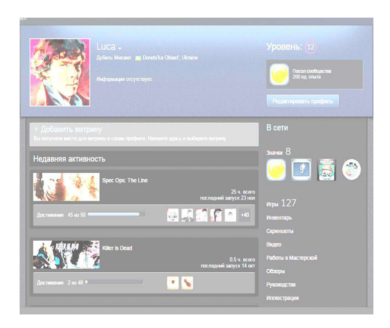
Fig. 1. Interface of the Steam service player [2]

On the picture 1 you can see the nowadays look of the Steam network gamer's page. Each gamer can change his page a little by adding the additional information about himself or his achievements in different aspects of the Steam service, such as the amount of games purchased, progress in the gaming process or even such specific art manifestations as crafts in the Steam workshop. Every player has his rank. This rank can be improved in several ways. First is collecting the stuff belonging to some certain categories inside the game. Second is being the active player of the Steam service. Sometimes players spend money on improvement of their ranks. There are some tasks inside the Steam system that do not belong to any certain game and can be performed by service player of any rank.