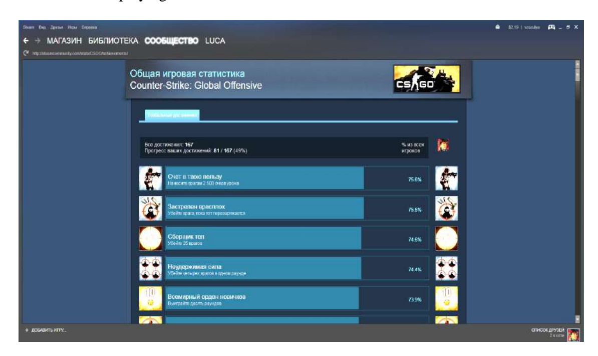
Fig. 3 The system of achievements in the computer game Counter-Strike:Global Offensive [4]

The possibility of participants' competition in different categories of achievements is a very important part of any social sphere. The developers of Valve Company decided not to miss the chance of providing their service with such opportunity. Most of the games have a system of achievements that allows players to compete with each other. Now these achievements are even added into the older games to make them more attractive and to increase the interest in playing them.